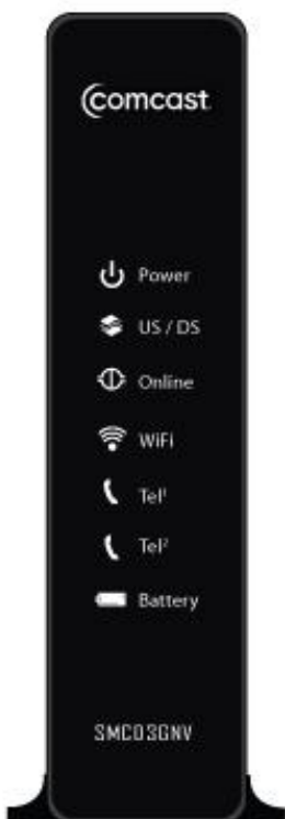
Table 1. Front Panel LEDs

Error! Reference source not found. shows the front panel of the SMCD3GNV Wireless Cable Modem Gateway. Error! Reference source not found. describes the front panel LEDs.