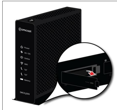
Figure 3. Removing the Battery Compartment Door