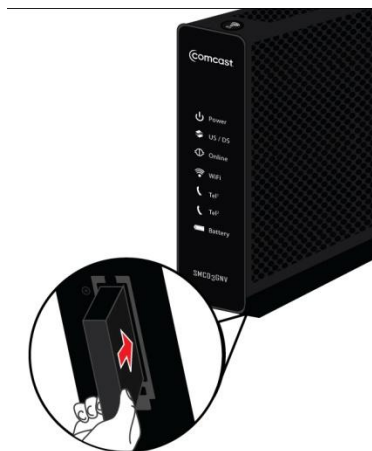
Figure 4. Installing the Battery