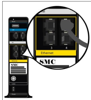
Figure 5. Connecting to an Ethernet Port on the Gateway Rear Panel