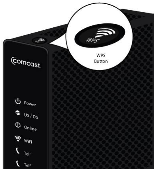
Figure 2. Top View of the SMCD3GNV Wireless Cable Modem Gateway

The top panel of your SMCD3GNV Wireless Cable Modem Gateway has a WPS button for configuring wireless security automatically. Figure 2 shows the WPS button.